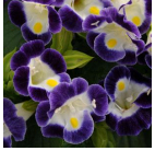
Blue & White